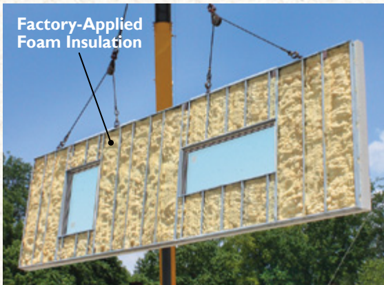
Factory-Applied Foam Insulation